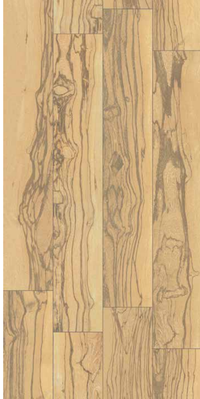
ULTRAMOD DESIGN V2