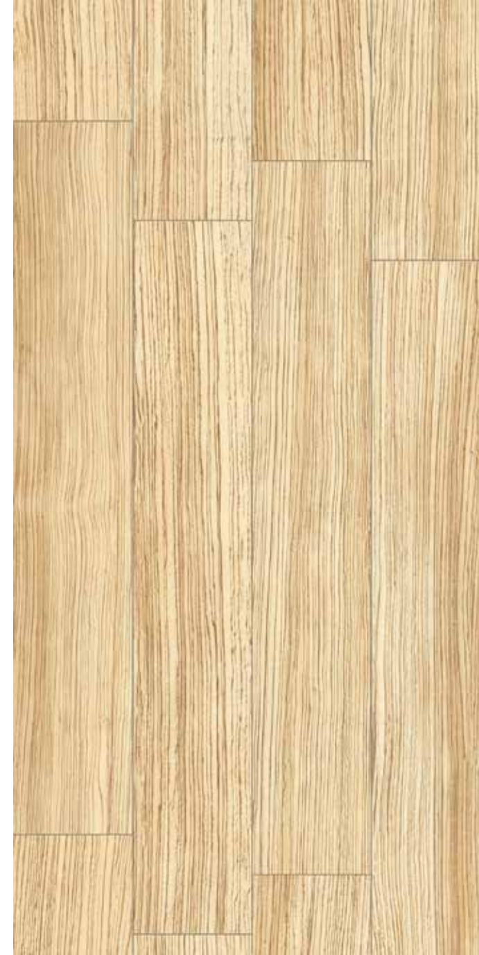
ULTRAMOD STRIPE V2