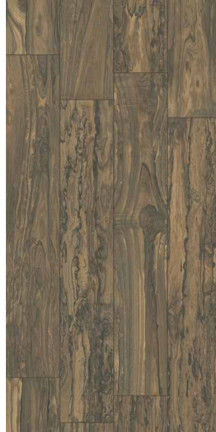
ULTRAMOD CLOUD V2