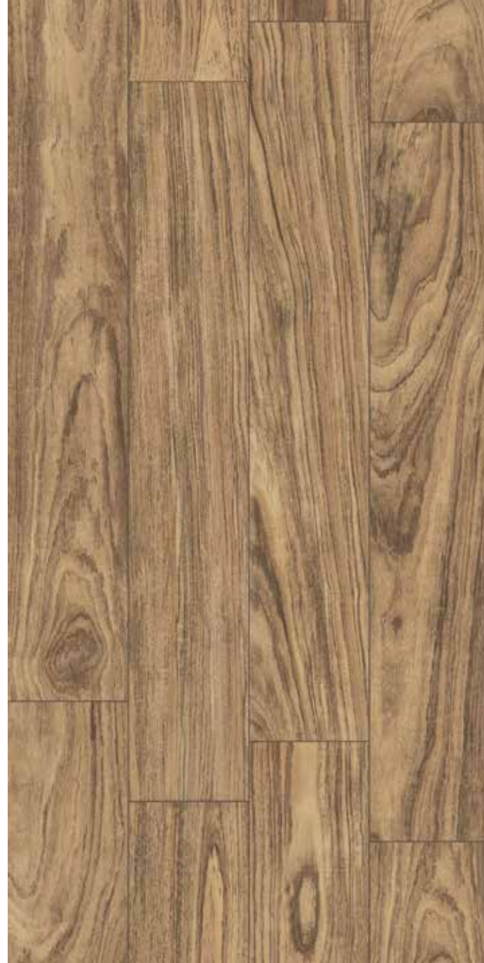
ULTRAMOD WALNUT V2