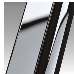
Chrome PVD not available for floor solution